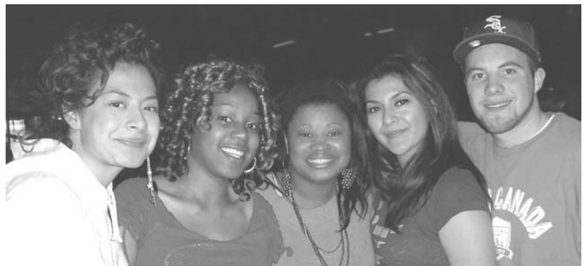
ReAct Program members at the Bowlathon

It was a great time and very important to our Respect in Action: Youth Preventing Violence program (ReAct) to be able to continue doing violence prevention work with diverse young people. All in all, the Bowlathon raised $15,000 to help ReAct!