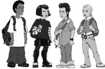
RePlay game characters

RePlay is METRAC's special project for children and youth aged 8 to 14. Funded by the Ontario Women's Directorate, it seeks to promote healthy, equal relationships amongst diverse children and youth through the mechanism of an educational online video game. The RePlay Project started with a series of focus groups, consisting of more than 250 children and youth throughout Ontario – this helped us ensure that the game is grounded in their needs and preferences.