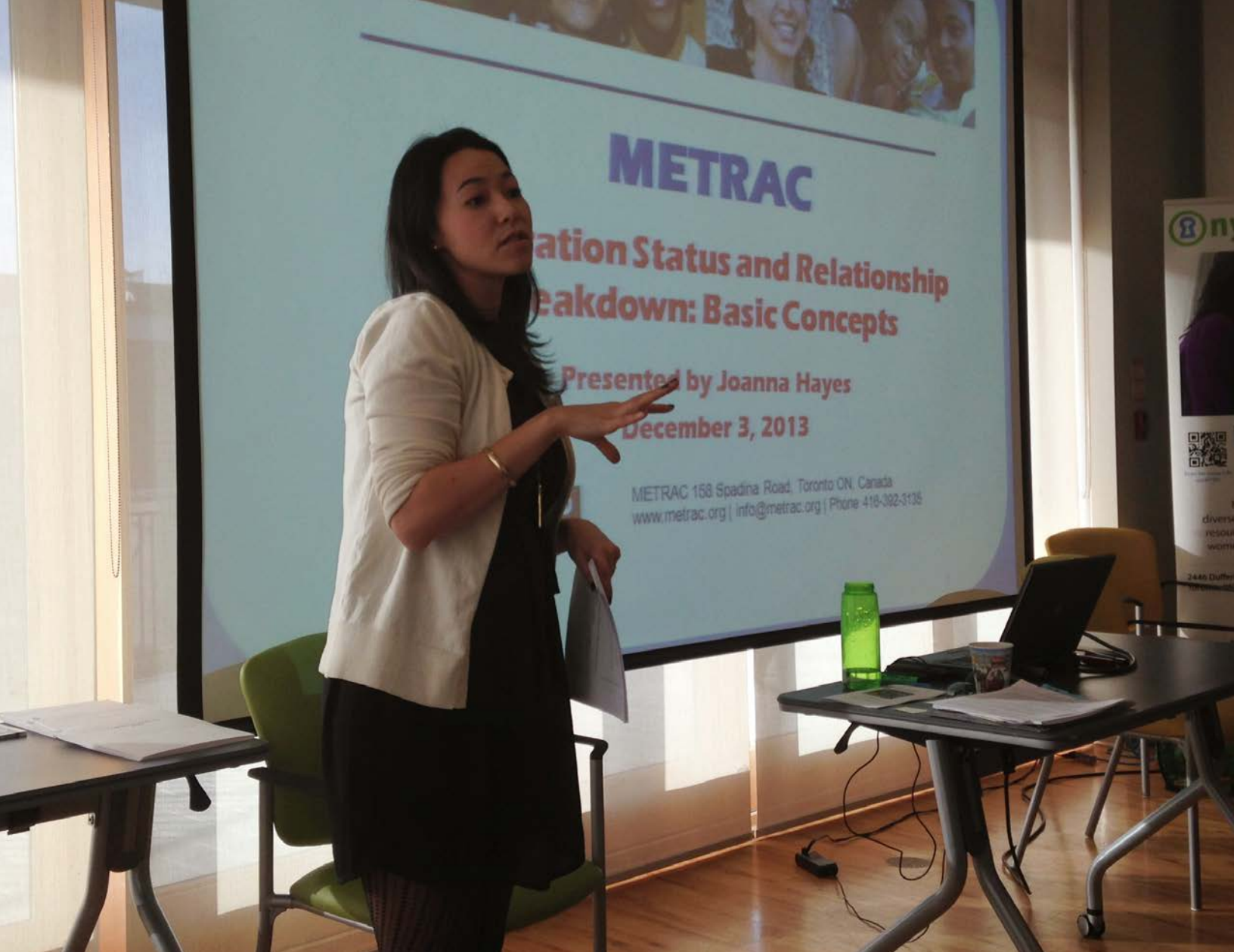
Image: legal information training for women and service providers