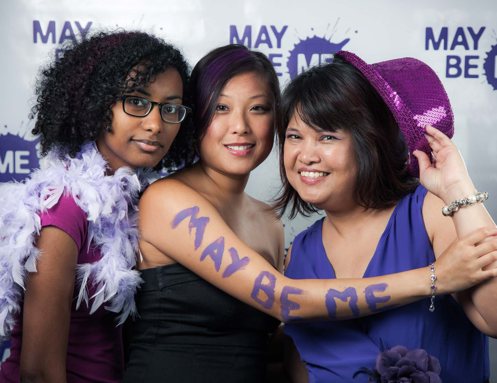
Image: May Be Me Celebration on May 31