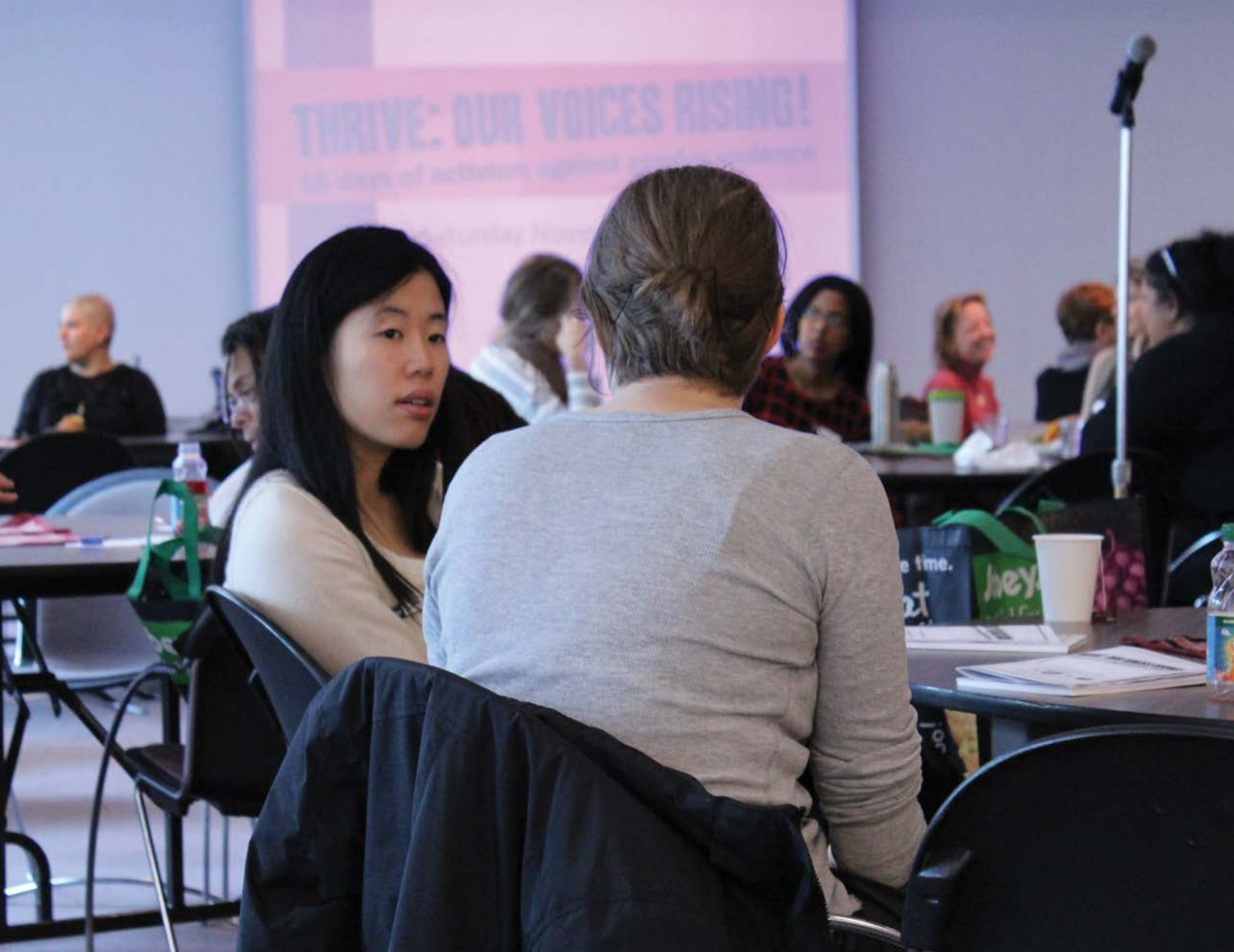
Images: on cover, Community Safety Audit group; above, THRIVE learning forum