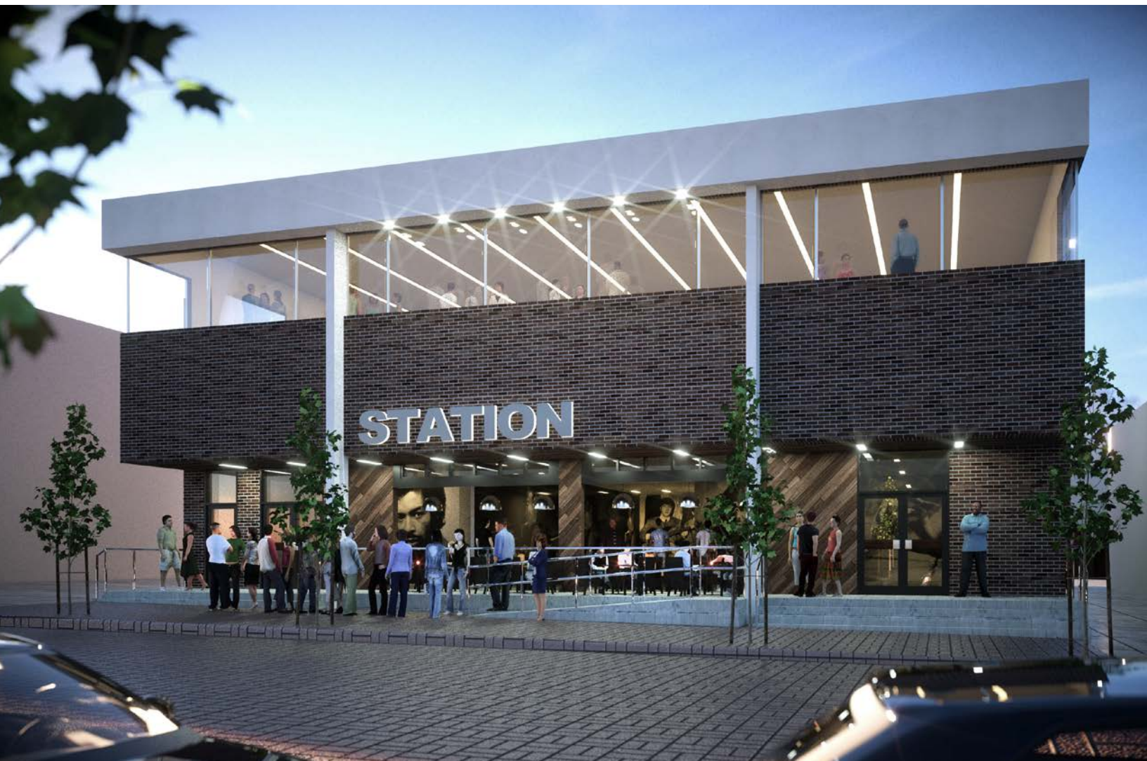
Image: artist rendering of "The Station" violence prevention centre in fundraising event context