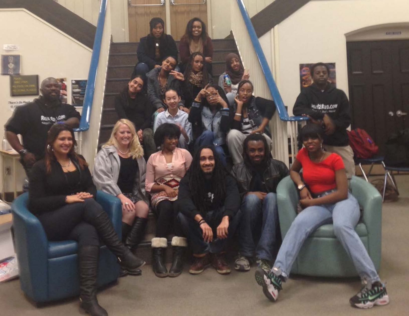
Image: ReAct after-school program group