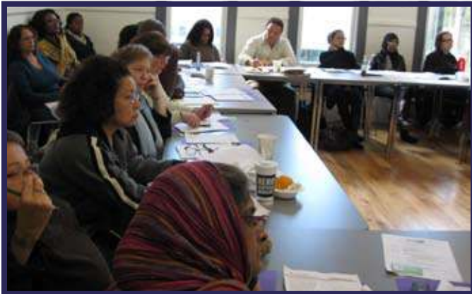
Legal information training

In our 2009 Annual Report, we highlighted our Community Justice Program's engagement in an evaluation based on dimensions of relevance, effectiveness, efficiency and sustainability of its activities. A final report was provided by PSTG Consulting in February 2010. Overall, the evaluation results demonstrated that the Justice Program is of value because it provides high quality information to service providers, women experiencing violence and the broader community about relevant legal issues not readily available from other sources. The program is perceived as addressing diverse needs of