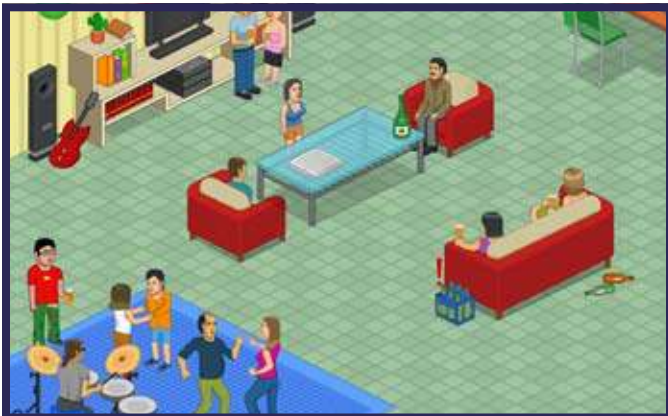
Screenshot from What It Is. game

METRAC's Outreach and Education Program has been heavily active over 2010. Our Respect in Action (ReAct) youth violence prevention program team has done excellent work across the city and beyond. Over the year, over 1000 diverse youth and educators participated in our workshops, speaking engagements and trainings on violence against women and youth. Of 896 youth workshop participants surveyed, 56% said they learned "a lot" of new things and 38% said they learned "some" new things; 87% said ReAct Peer Facilitators did "great" and 12% said ReAct Peer Facilitators did "okay"; 86% rated the workshop "great"; and 12% rated the workshop "okay". Of 33 educators and youth workers surveyed, youth