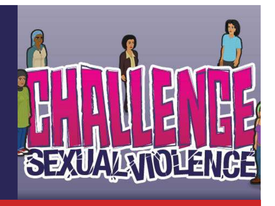
Image: www.challengesexualviolence.org, newly launched home to What It Is . digital game challenging sexual violence against youth

"[The game content is relevant] because I know people in that situation." (Youth focus group participant, informing design of the digital game, What It Is.)